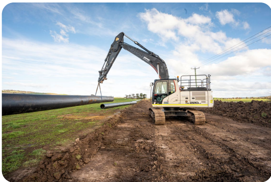
Pipe welding - Ashby Road