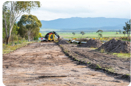
Topsoil stripping - Barton Road