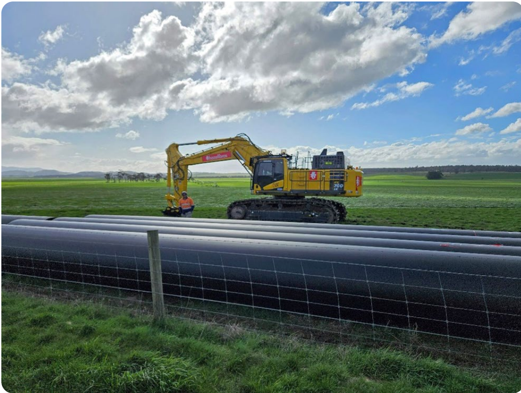
Pipeline construction, NM1 Zone, Cressy