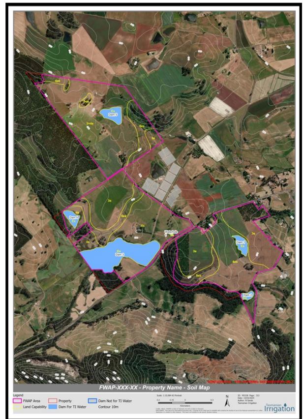
Example Farm WAP soil map

For any Farm WAP-related inquiries or assistance, don't hesitate to reach out to our dedicated Farm WAP Team at (03) 6398-8433 or email FarmWAP@tasirrigation.com.au .