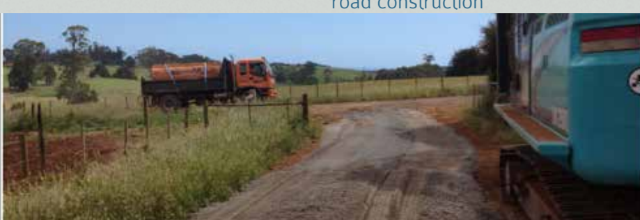
Figure 4: Commencement of access road construction